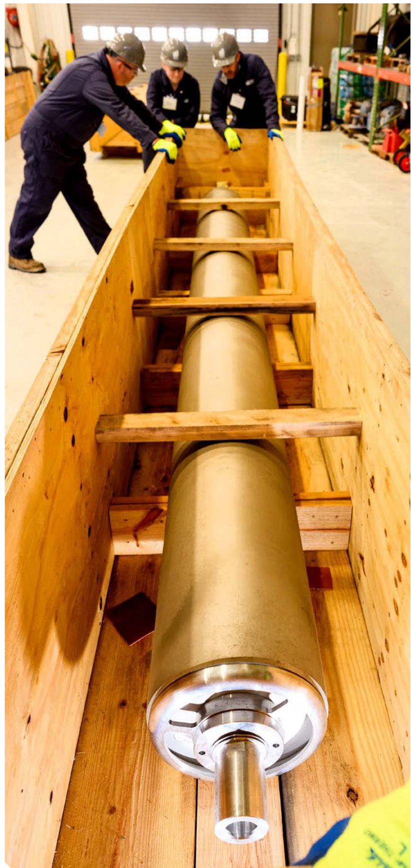
The final UCS canister is inspected at the Deep Borehole Demonstration Center in Texas. Project UPWARDS completed a three-year project to manufacture, physically test, and validate a disposal-ready universal canister system capable of storing, transporting, and disposing of advanced reactor waste.