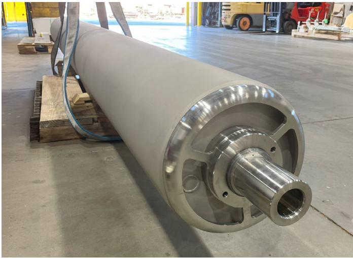
Pictured is Deep Isolation's Universal Canister System, which is designed to safely store, transport, and dispose of SNF and high-level radioactive waste.

Costs were estimated across the full repository lifecycle, including siting, licensing, construction, operation, closure, and post-closure institutional control. Sensitivity analysis was subsequently performed to assess the effects of contingencies.